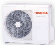
Outdoor unit (symbolic image)