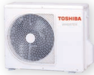
Outdoor unit (symbolic image)